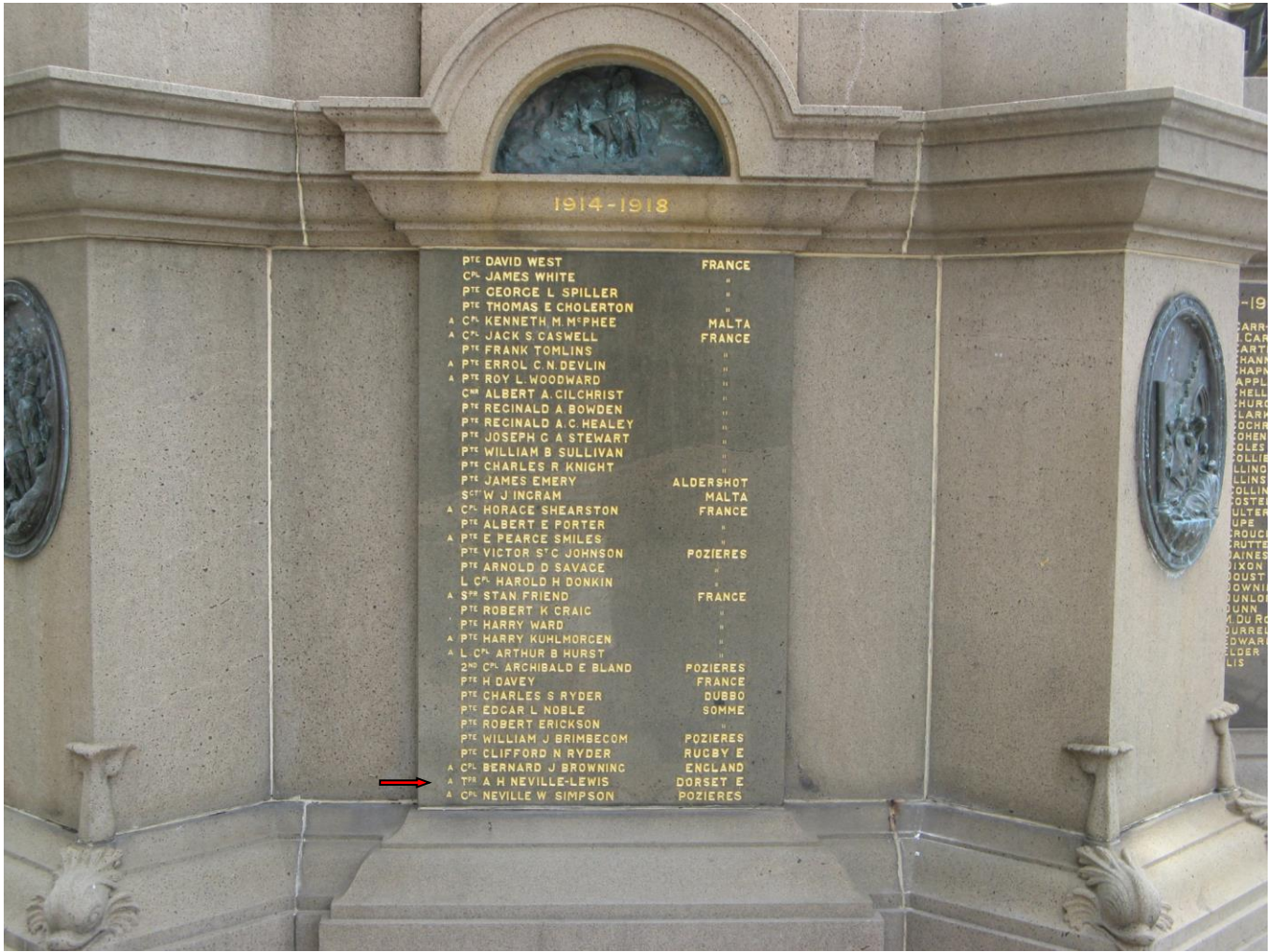
Manly War Memorial